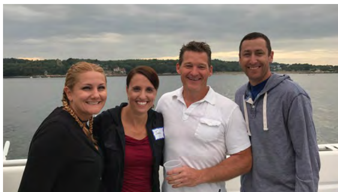
The annual Sunset Cruise was a huge success! Thank you to our sponsors and everyone who came aboard. Special thanks to presenting sponsor Connected Home Care.