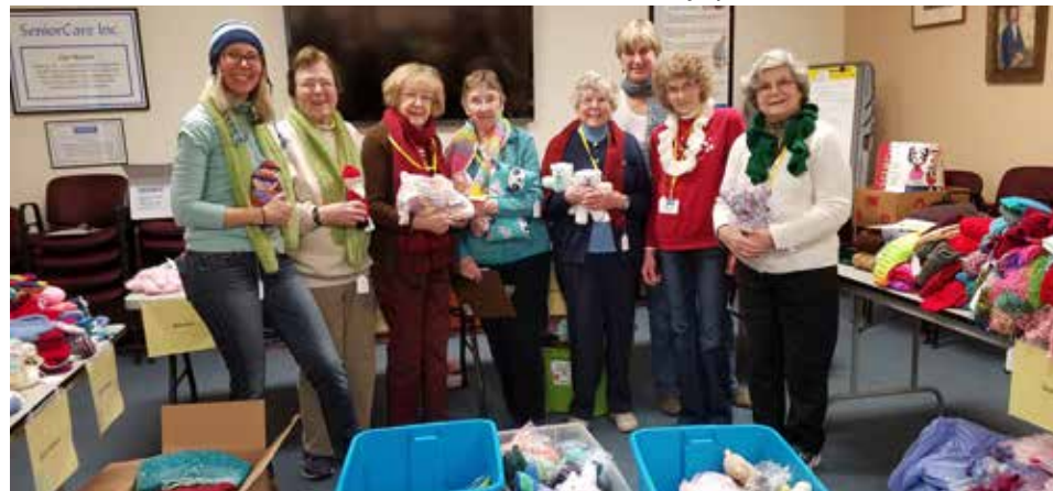
Volunteers helped to sort the donations for nonprofits. (photo prior to covid)